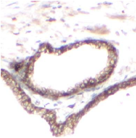
Immunohistochemistry of paraffin-embedded human prostate tissue slide using FNab10718(DAB2 antibody) at dilution of 1:100